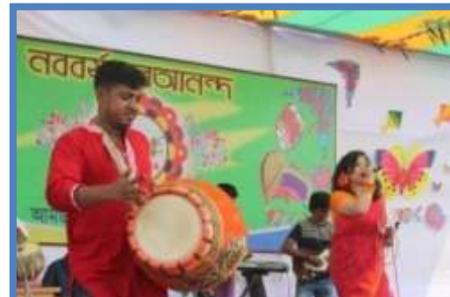
Amazing moments of "Nabobarsho 1425" Celebration

c. Physical standard. The candidates must be physically fit and conform to the minimum physical standard as laid down below: