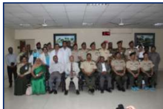
BM&DC Visiting Team at AFMC and KGH