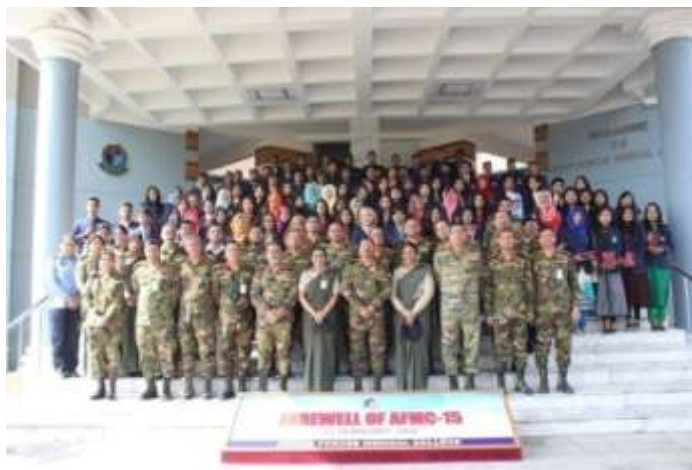
Faculty members with Commandant, AFMC at Farewell Party of AFMC-15