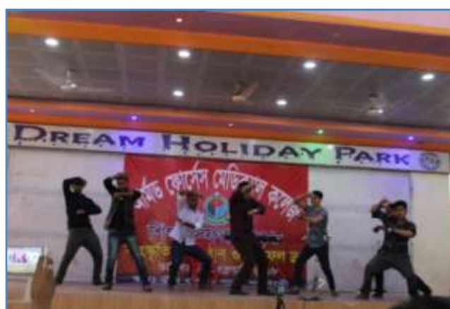
Study Tour-2018 of AFMC