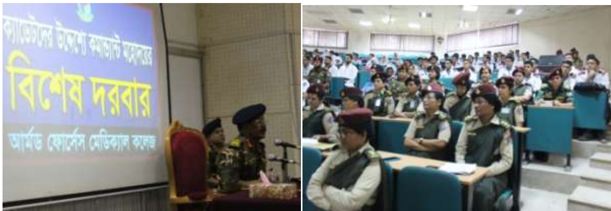
Commandant address to All faculty members and cadets of AFMC