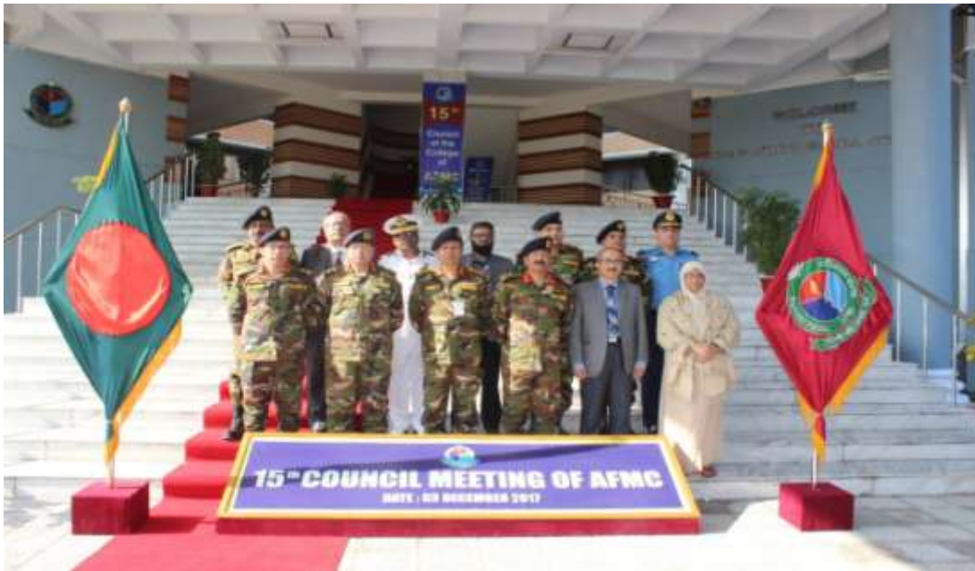
General Abu Belal Muhammad Shafiul Huq, ndc, psc, Chief of Army Staff with other members of the Council of the College