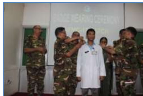
Badge wearing ceremony of cadets

49. Foundation Course. Medical Science is taught in English. Therefore sound knowledge in English is required for acquiring medical education. The foundation course for duration of 04 weeks has been introduced for the cadets at the very beginning of the course. It is observed that the Foundation course has imparted positive effects in improving the shortcoming of newly admitted cadets.