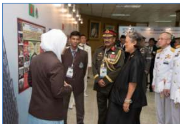
AFMC Team Participation in ICMMS, Thailand

51. Internship Training. After passing final professional examination, the newly passed doctors are to undergo 01 year compulsory internship training in the Kurmitolla General Hospital/CHM Dhaka, a prerequisite for getting Bangladesh Medical and Dental Council (BMDC) registration. During internship training the passed out doctors are paid honorarium, the amount commensurating with that paid to the doctors doing internship training in Government Medical College Hospitals.