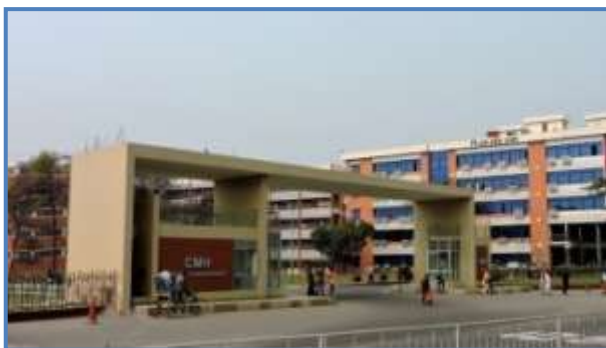
Combined Military Hospital, Dhaka

In addition, for the purpose of understanding the sufferings of humanity and their management, cadets are exposed to Government hospitals e.g Dhaka Medical College Hospital (DMCH), Shaheed Suhrawardi Medical College Hospital (ShSMCH), Infectious Disease Hospital (IDH), Mohakhali, Dhaka etc.