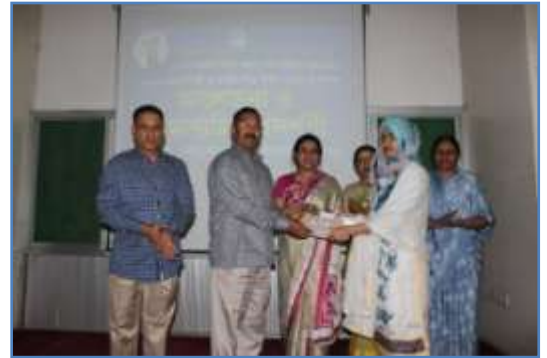
Commandant with Faculty Members presenting the award on Essay competition on the occasion of 99th birthday of Father of the Nation Bangabandhu Sheikh Mujibur Rahman & National Children's Day