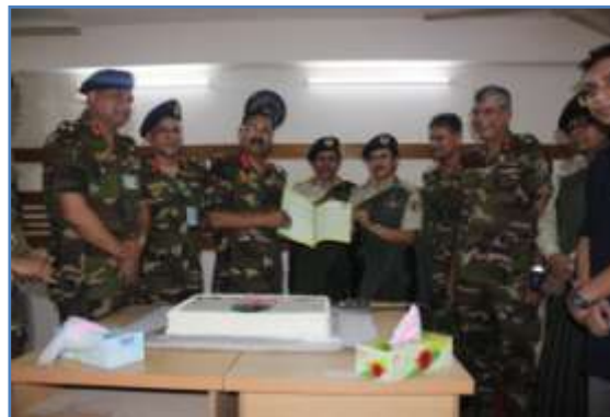
Inauguration of Utopia and AFMC Med Carnival & Photography-2018