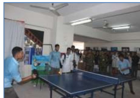
Cadet's perform in Indoor, Outdoor Games & Cultural Week