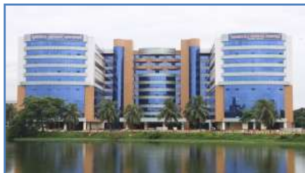
Kurmitola General Hospital