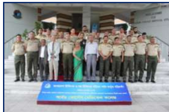
BM&DC Visiting Team at AFMC and KGH