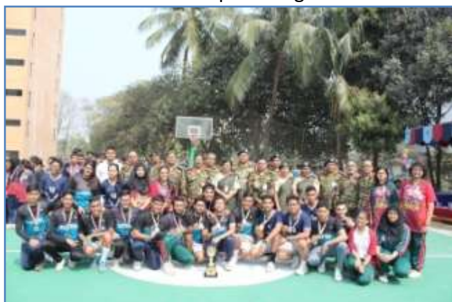
Annual outdoor games competition 2018

Tk 10,00,00/- (Taka Ten Lac only) plus double the expenditure borne by AFMC for training of the Medical cadets with 10% interest plus allowances paid during 'one years' internship training.