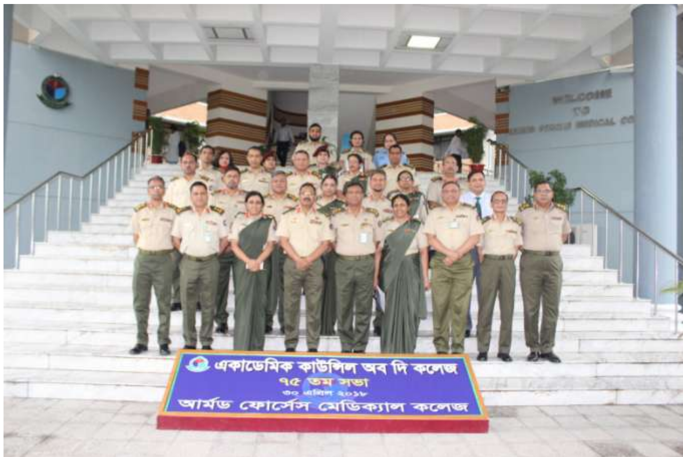
The Members of Academic Council of the College