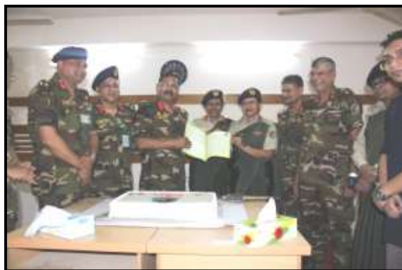
Commandant, AFMC Inauguration of Photography Exhibition-2018 "Louder Than Word".

15. Cafeteria/Canteen. A cafeteria/canteen situated within the premise of the college provides light refreshment to the cadets on payment.