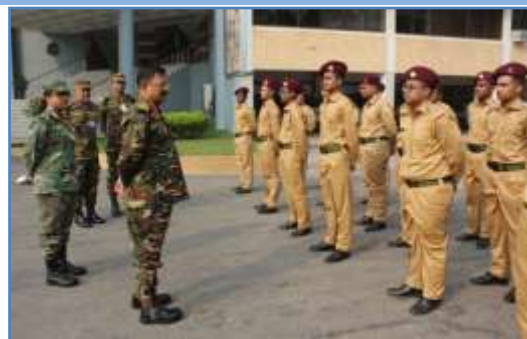
Drill session of AFMC cadets

44. Professional Training. AFMC follows undergraduate medical course curriculum approved by the Bangladesh Medical and Dental Council and by the Faculty of Undergraduate Medicine of Bangladesh University of Professionals (BUP). On Successful completion of the course and on passing final MBBS examination the medical cadets are awarded MBBS degree from Bangladesh University of Professionals (BUP). The duration of the course is of 05 academic years (excluding 01 year compulsory internship training required for registration to BMDC).